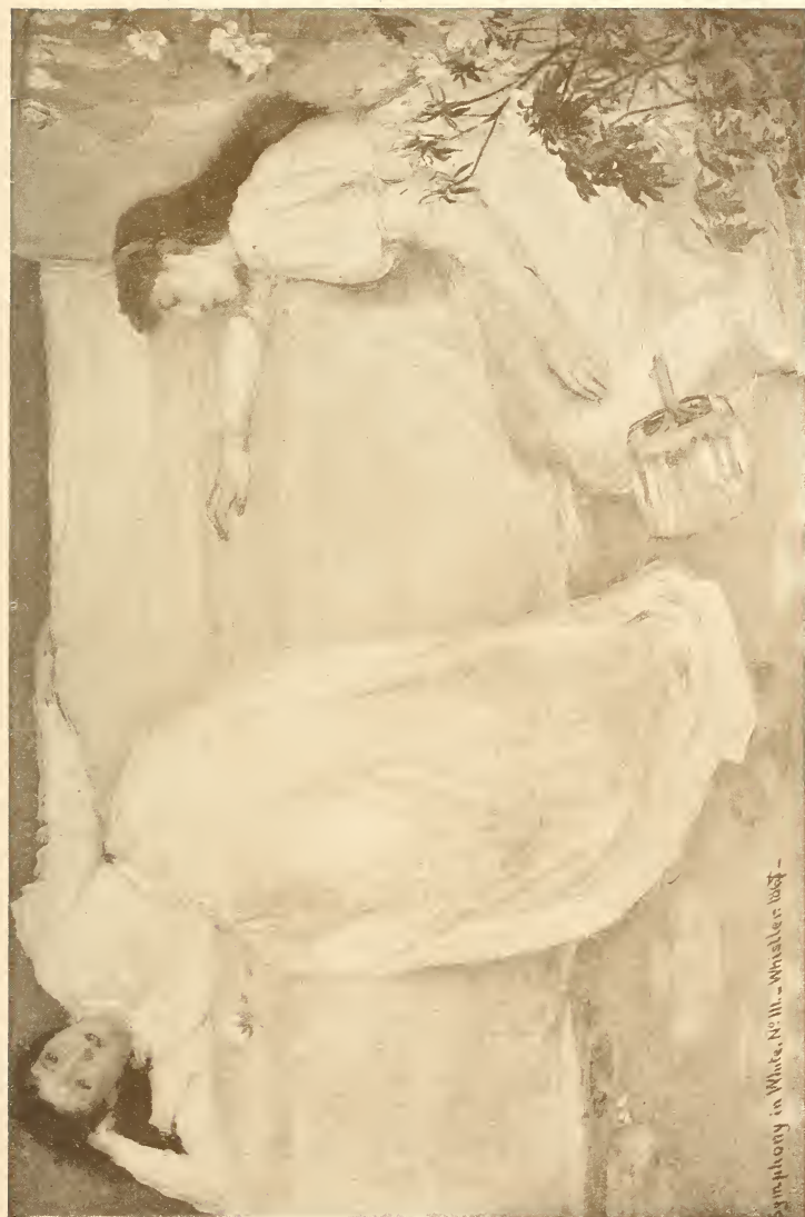
Symphony in White, No. 3. WHISTLER, 1868.